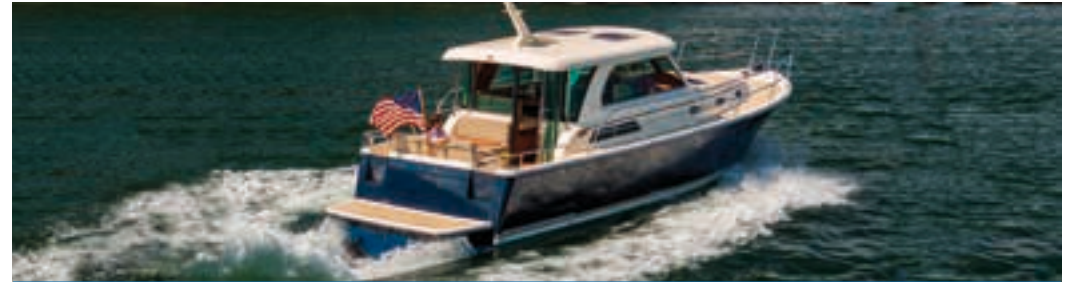
Motor Yachts / Commercial Vessels

ZF 2000 / ZF 3000 / ZF 5000 / ZF 9000 ZF 11000 / ZF 23000 / ZF 24000 / ZF 30000 ZF 40000 / ZF 53000 / ZF 60000 / ZF 83000 ZF 3300 PTI / ZF 5300 PTI / ZF 9300 PTI ZF 24300 SG / ZF 30300 SG / ZF 40300 SG