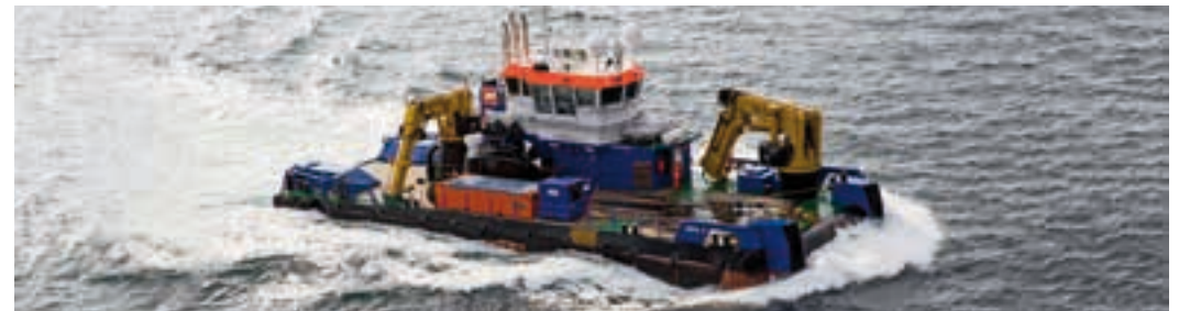
Commercial Vessels (i.e. Support and Supply Vessels, Barges, AHTS Vessels)