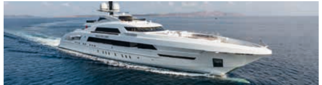
Superyachts / Commercial Vessels / Patrol Vessels / Fast Ferries

ZF W200 / ZF W300 / ZF W600 ZF W1000 / ZF W2000 / ZF W3000 ZF W5000 / ZF W7000 / ZF W10000 ZF W11000 / ZF W17000 / ZF W30000 ZF W40000 / ZF W60000 / ZF W80000 ZF W90000 / ZF W100000