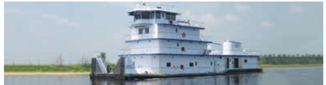
Commercial Vessels (i.e. Maintenance and Support Vessels, River Push Boats, Dredgers)