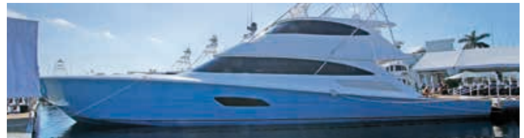
Motor Yachts / Sport Fishing Boats / Commercial Vessels