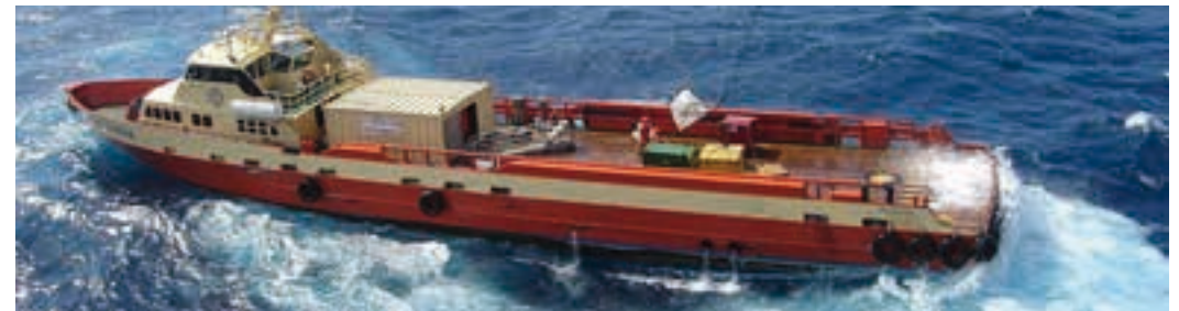
Motor Yachts / Commercial Vessels