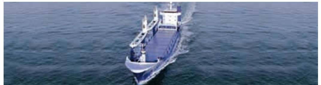
Commercial Vessels (i.e. Barges, Cargo Vessels, Ferries, Tugs, Tankers)