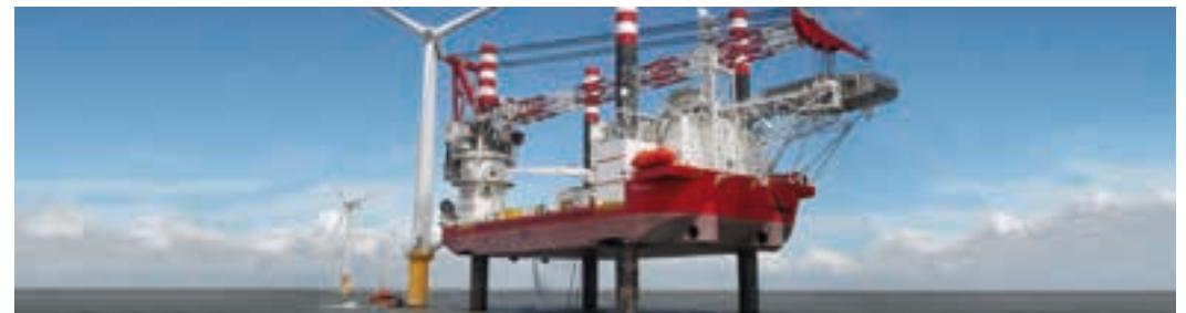
Commercial Vessels (i.e. Cable Layers, Jack-up Vessels, Barges, Carriers, Ferries)