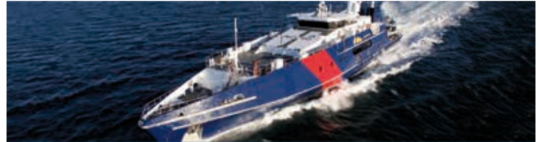
Superyachts / Government Vessels / Commercial Vessels (i.e. Supply Vessels, Cargo Vessels, Ferries)