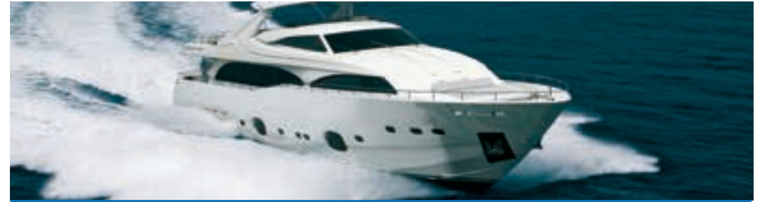
Motor Yachts / Government Vessels